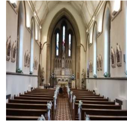
St Peter's Catholic Church 7 St Peter's Road Cirencester Gloucestershire GL7 1RE